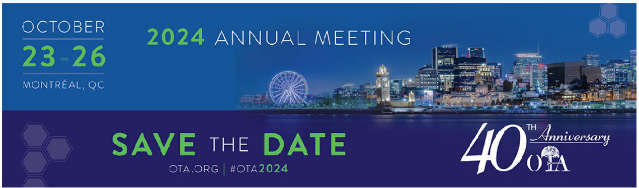
Save the Date for the 2024 Annual Meeting - Housing is OPEN

The Orthopaedic Trauma Association's 40th Annual Meeting, along with all pre-meeting and concurrent events, is scheduled to take place at the Montréal Convention Center, located at 1001 Pl. Jean-Paul-Riopelle, Montréal, Canada. The Annual Meeting will commence at 8:00 AM, Thursday October 24, 2024 and will conclude at 12:00 PM, Saturday, October 26, 2024. The pre-meeting events will begin on Wednesday, October 23rd.