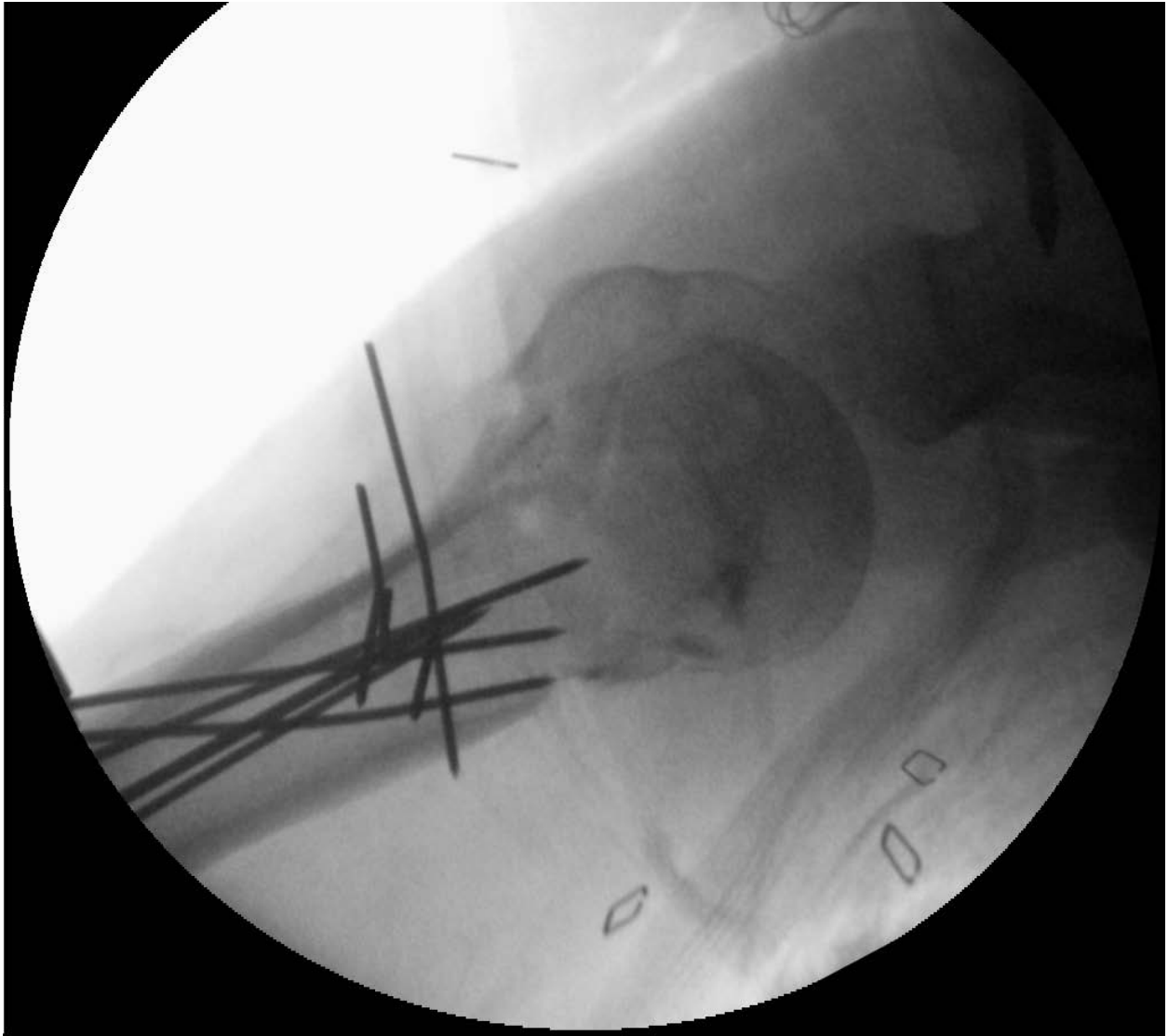
Figure 1: UNSATISFACTORY REDUCTION: This axillary lateral of a comminuted proximal humerus fracture was made after K-wire fixation of the meta-diaphysis. Note that the humeral head appears to be reduced to the metaphysis, however, the lesser tuberosity fragment remains unreduced, since humeral length has not been restored, and there is insufficient room for this fragment between the head and the humeral meta-diaphysis.