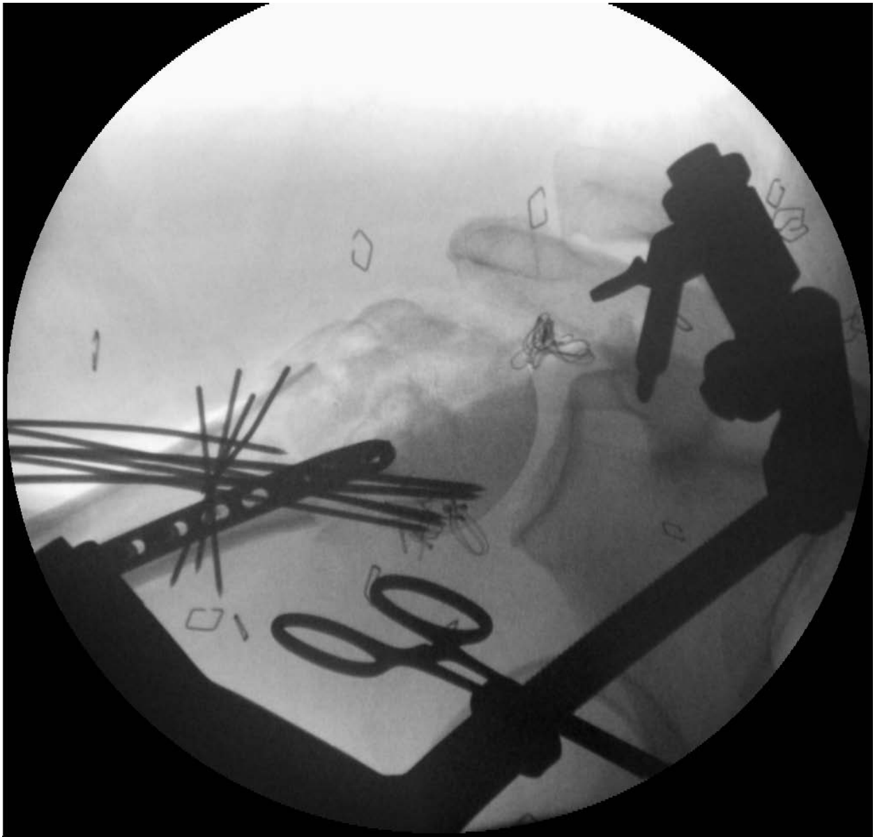
Figure 2: AP view after application of an anterior distractor. Additional distraction allows reduction of the lesser tuberosity, which has been stabilized provisionally with an anterior 2.7mm plate.