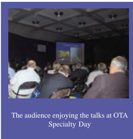
The audience enjoying the talks at OTA Specialty Day

The afternoon session included Femoral Nailing Tips and several lectures on reduction tactics for long bone stabili-