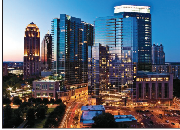
Atlanta Skyline

Dear Orthopaedic Surgeons and Surgical Care Teams: