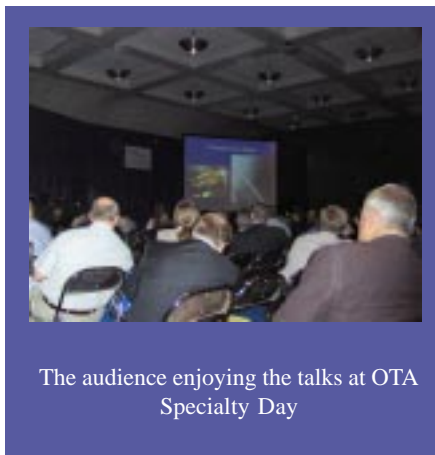
The audience enjoying the talks at OTA Specialty Day