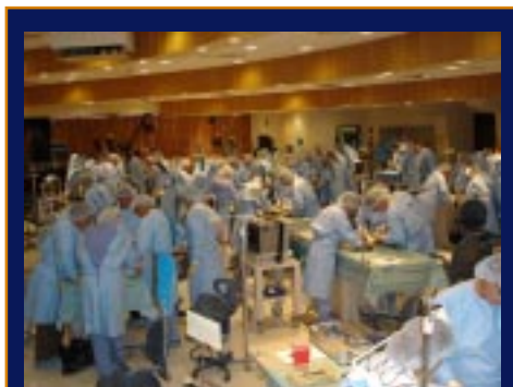
These are not mad scientists at a government nuclear laboratory but participants at the recent AAOS/OTA Techniques in Orthopaedic Trauma Course held at the Orthopaedic Learning Center Lab.